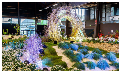
Loire-Atlantique union florists