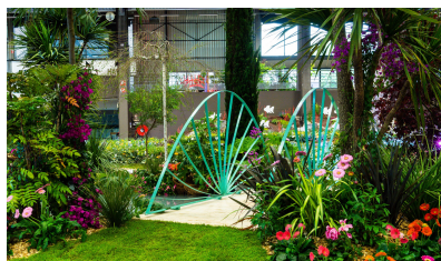
A. and L. Feviero landscaper