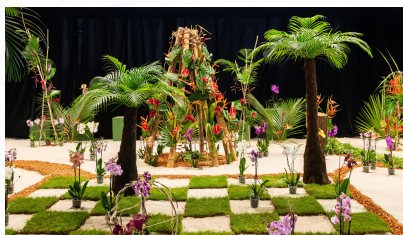
Natural Parc in Martinique